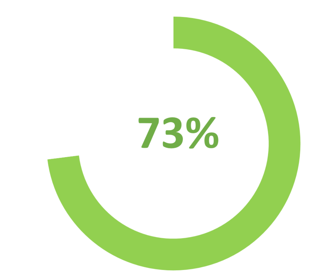
ADHERENCE TO THE INTERVENTION